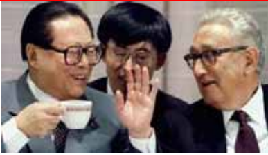
Kissinger with Jiang ZM

After the case of MH370 thirty days , Mr. Henry Alfred Kissinger at Asia Society Policy Institute the ceremony of establish to blurt out: “ Mr. Jiang ZM at assume office on the initial stage that greatly to underestimate by the external world, ” ! After all, what “ capability ” to underestimate?