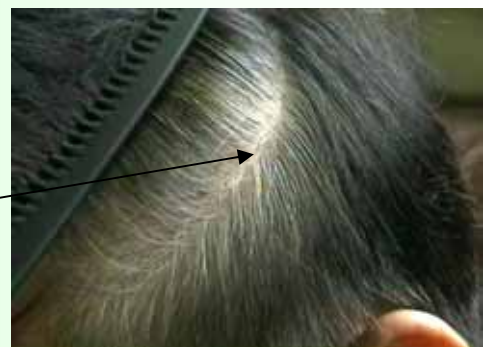
This photo taken on Aug.2, 2002, lzm was to stop the hair dye after 55days and sixth of haircut, those old rinse part it still at here, but the white-headed of low-oblique which was to turn gray-black.

拍攝者: [Signature] 身份證: 362243-1-202206628 2002年7月26日